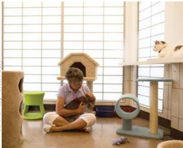
Potter League for Animals, Middletown, RI; ARO Architects