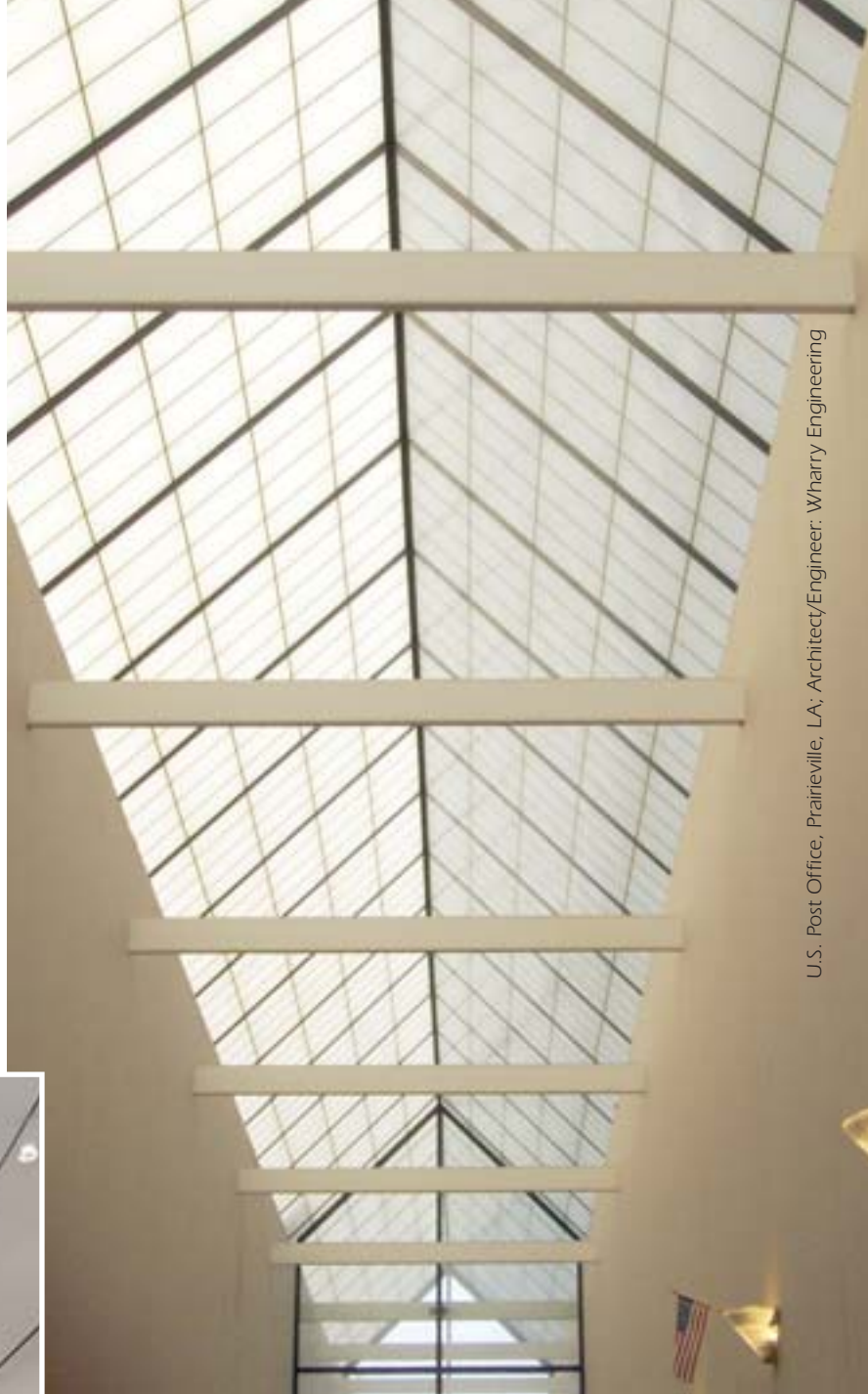
U.S. Post Office, Prairieville, LA; Architect/Engineer: Wharry Engineering