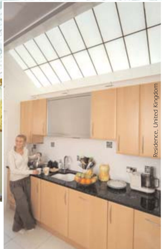
Residence, United Kingdom

Kalwall+ Lumira panels available for most of Kalwall's 8 Building Systems, including this huge Clearspan™ Skylight by Kalwall strategic partner Structures Unlimited, Inc.